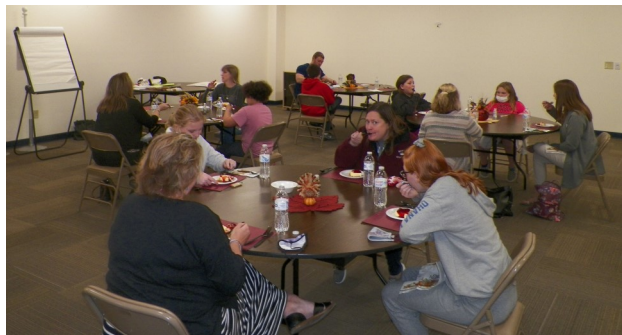
See more pictures on page 2.....

Manners, like mentoring, kind of boils down to showing respect and valuing ourselves and each other!